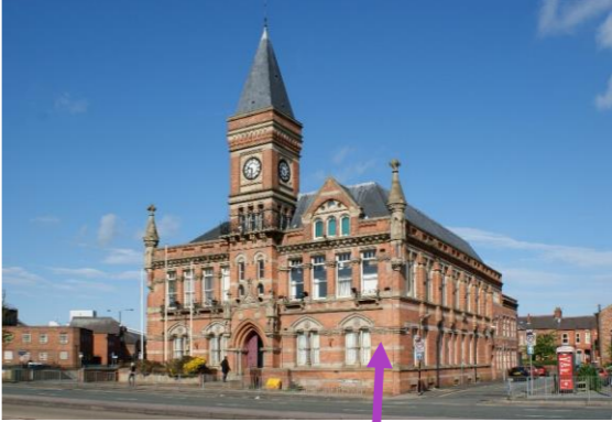
Significant building in the local area